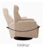
Gliding/ Rocking function