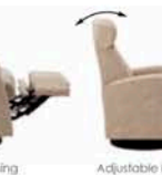
Adjustable head- and neck support